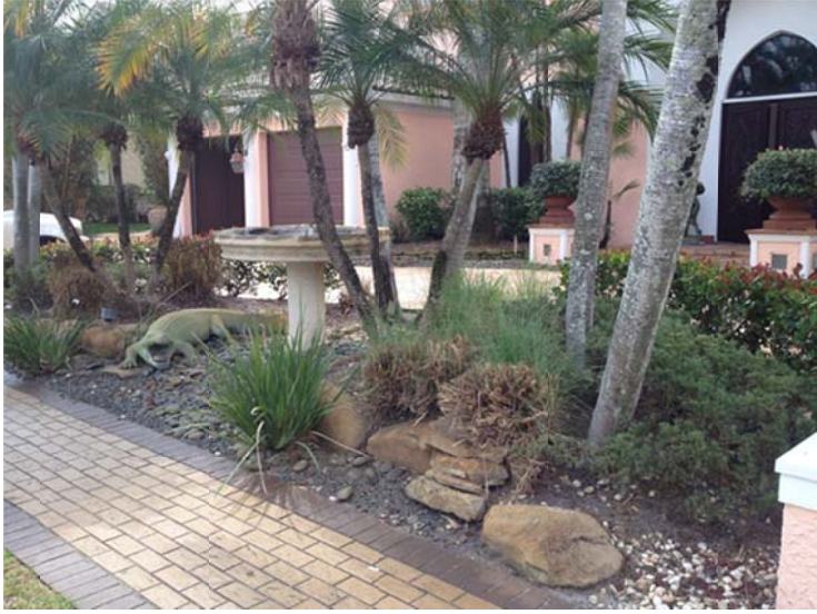
March 2015 Pictures Street View – Broken Moldy Fountain Missing Statue - Dead Landscape