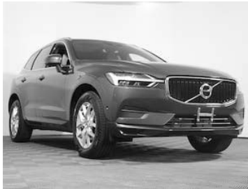
2018 VOLVO XC60 T5 MOMENTUM SUV