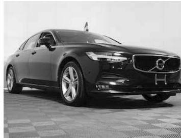
2018 VOLVO S90 T5 MOMENTUM SEDAN