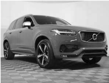
2016 VOLVO XC90 T6 R-DESIGN SUV