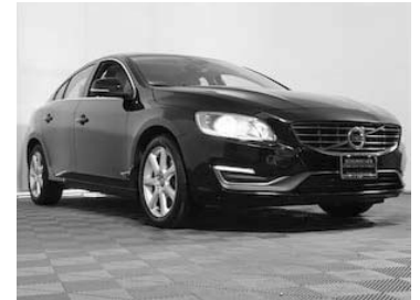
2016 VOLVO S60 T5 DRIVE-E PREMIER SEDAN