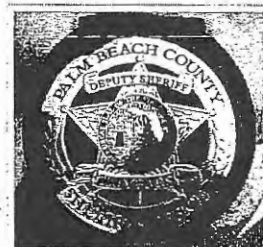
Palm County Florida Sheriff