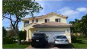
Client gets bad attorney's home