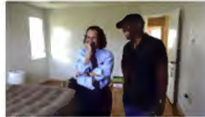
Photos: Lawyers rip off client, client moves in to lawyer's home