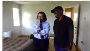
Client gets bad attorney's home