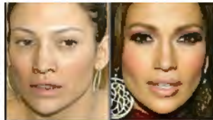
Celebs without makeup