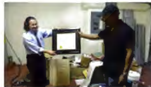
Client gets bad attorney's home