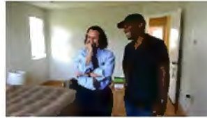
Video: Client gets lawyer's house