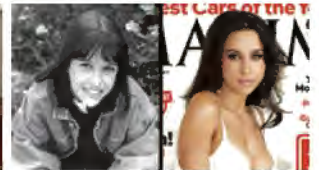
See pictures of child stars - then and now

Subscriber Services Classified Advertise Contact Us