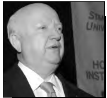
Samuel W. Bodman