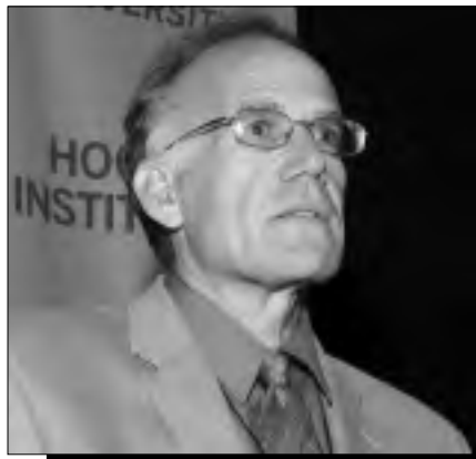
Victor Davis Hanson