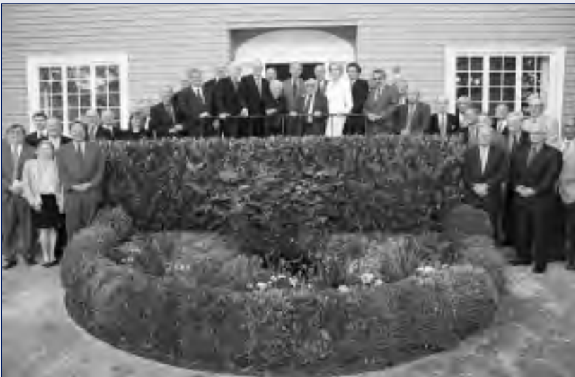
Hoover fellows and overseers, as well as Stanford University officials, gather with President Bush, center, at the conclusion of the meeting.