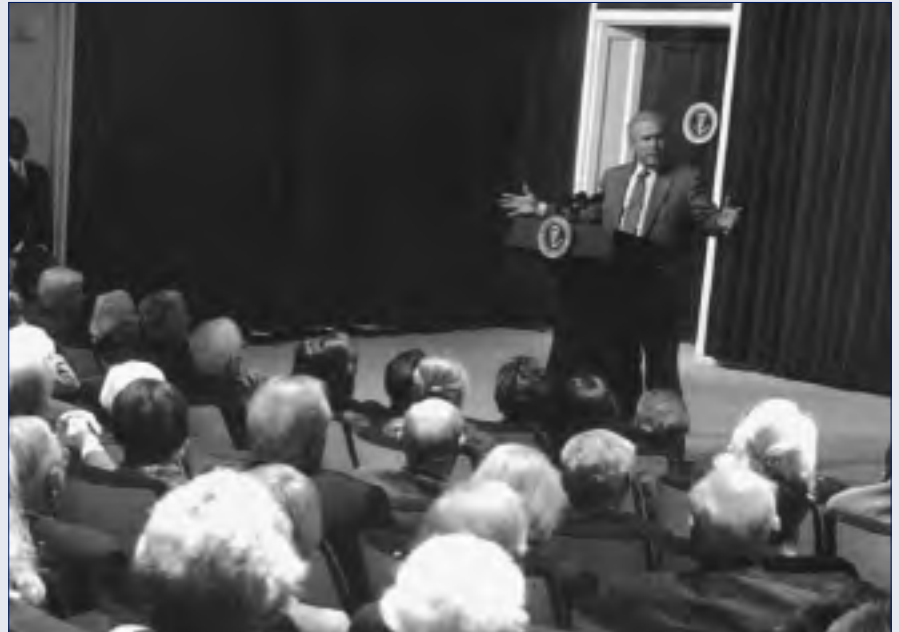
President George W. Bush speaks to Hoover Institution Overseers on February 27 at the Eisenhower Executive Office Building in Washington, D.C. The meeting was part of the annual Board of Overseers meeting in Washington.

Vice President Dick Cheney closed the Hoover Institution Board of Overseers meeting with remarks to overseers,