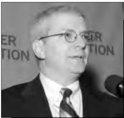
Joshua B. Bolten