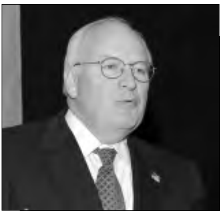
Vice President Dick Cheney