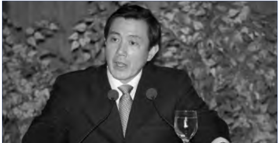
Ying-jeou Ma, chairman of the Kuomintang Party on Taiwan, attended the March 24 ceremony announcing the opening of the Chiang Kai-shek diaries.