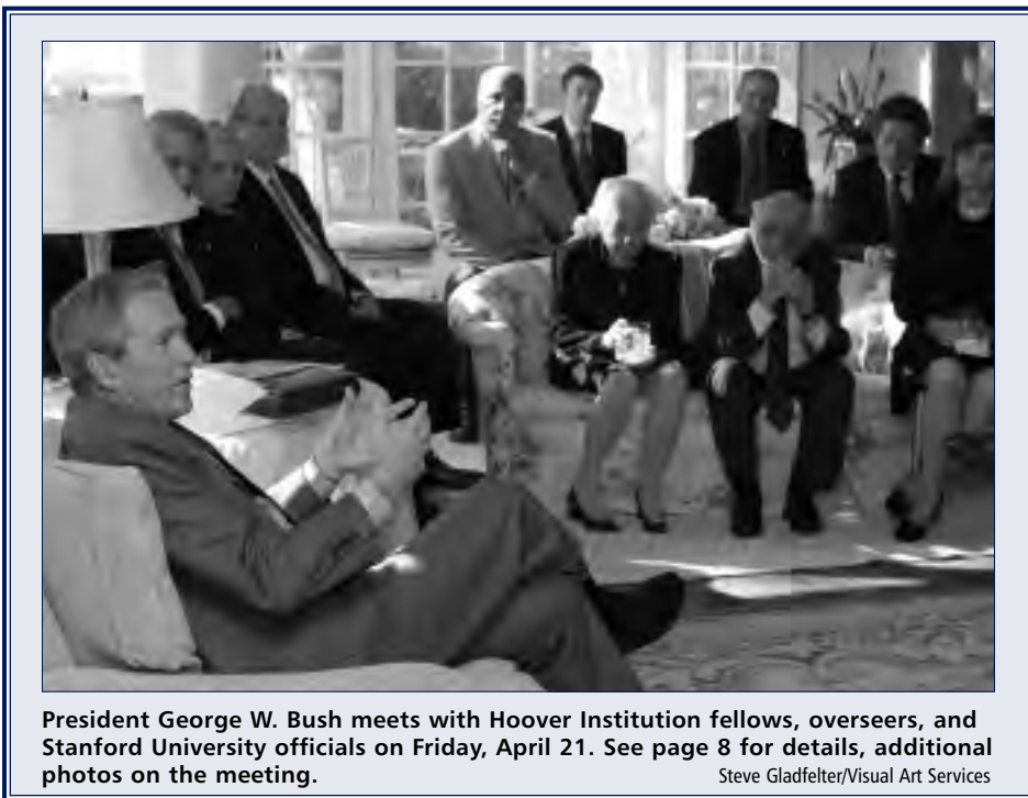
President George W. Bush meets with Hoover Institution fellows, overseers, and Stanford University officials on Friday, April 21. See page 8 for details, additional photos on the meeting.